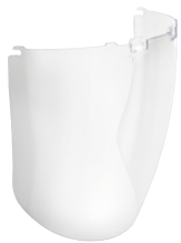
Replacement Clear Lens 288275