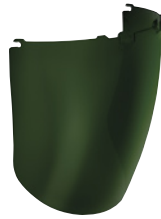
Replacement Shade 5 Lens 288277