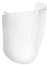
Replacement Clear + Anti-Fog Lens 288278