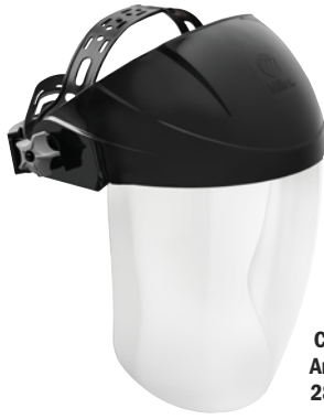
Clear + Anti-Fog 288274