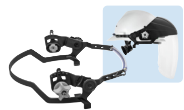
Halo Hard Hat Adapter 222003 Slotted Hard Hat Adapter Clips (Not Shown) 259637