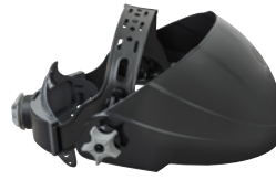
Replacement Headgear and Crown 288280