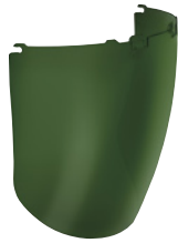
Replacement Shade 3 Lens 288276