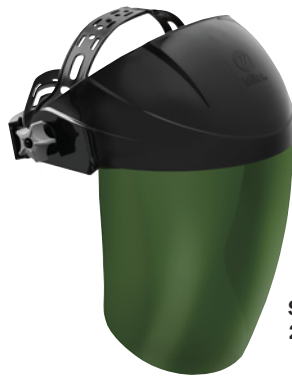
Shade 3 288270