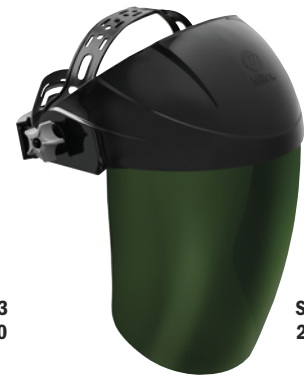
Shade 5 288273