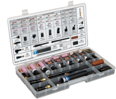
TIG Torch Accessory Kit AK-150MFC

TIG/Multitask Gloves 263352 Small 263353 Medium 263354 Large 263355 X-Large Goat grain leather with dual-padded palm and wool back.