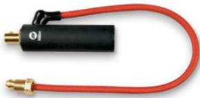
195377 50 mm Dinse-style with water return line for water-cooled torch.