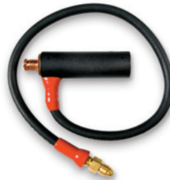
225028 50 mm thread-lock-style for water-cooled torch.