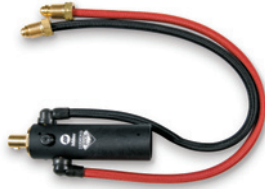
195380 50 mm Dinse-style gas thru with gas and water return lines for water-cooled torch.