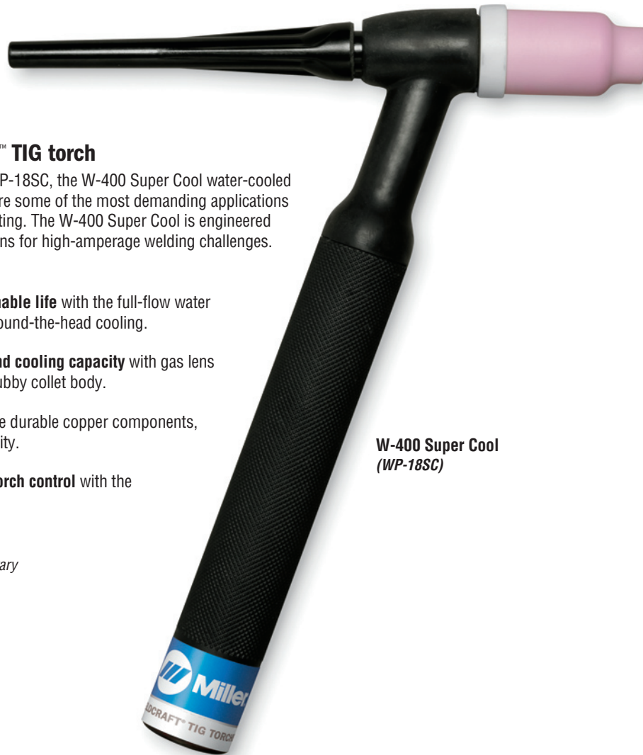
W-400 Super Cool (WP-18SC)