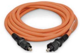
Air-cooled quick wrap