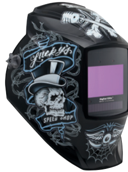
Lucky's Speed Shop™ 289756