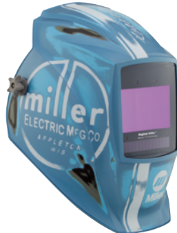
Vintage Roadster™ 289764