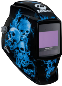
Blue Rage™ II 281010