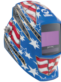
Stars and Stripes™ III 289759