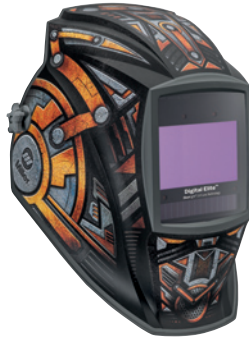
Gear Box™ 289844