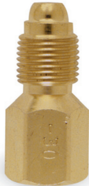
15001-30 surge protector