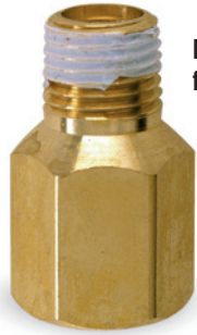
H1400-20 fixed-flow adapter