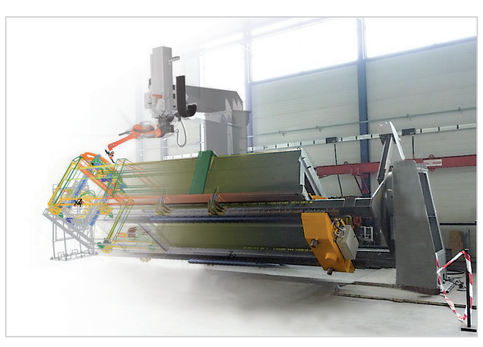
The Ultimate Virtual Reality Robotic Welding Automation Software