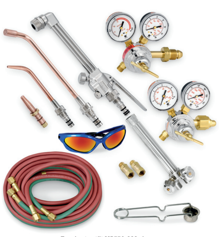
Toughcut outfit MB55A-300 shown.

Medium-duty oxy-fuel system for your cutting, heating and welding needs.